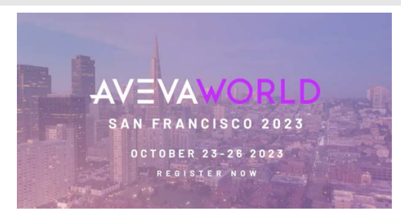
October 23rd - October 26th AVEVA World

Join us at AVEVA World in San Francisco to explore the latest in industrial software, connect with experts, and learn about technologies like industrial cloud platforms and digital twins. Don't miss this opportunity to deepen your technical expertise and network with peers in the industrial community.